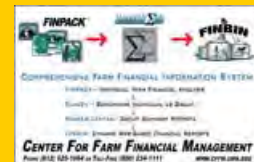
Center for Farm Financial Management