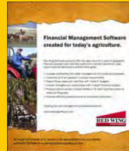
Red Wing Software

Click an image to view the full-size ad.