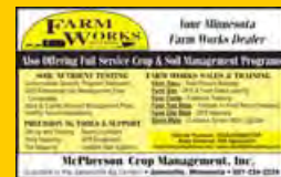
MacPherson Crop Management