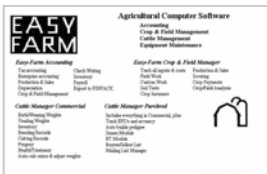
Vertical Solutions, Inc.