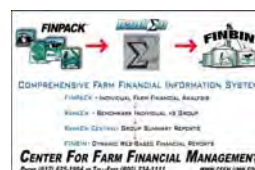
Center for Farm Financial Management