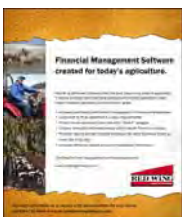
Red Wing Software