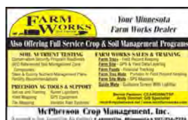
McPherson Crop Management, Inc.