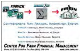
Center for Farm Financial Management