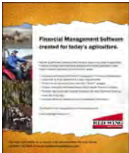
Red Wing Software