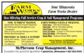
McPherson Crop Management, Inc.