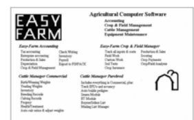
Vertical Solutions, Inc.