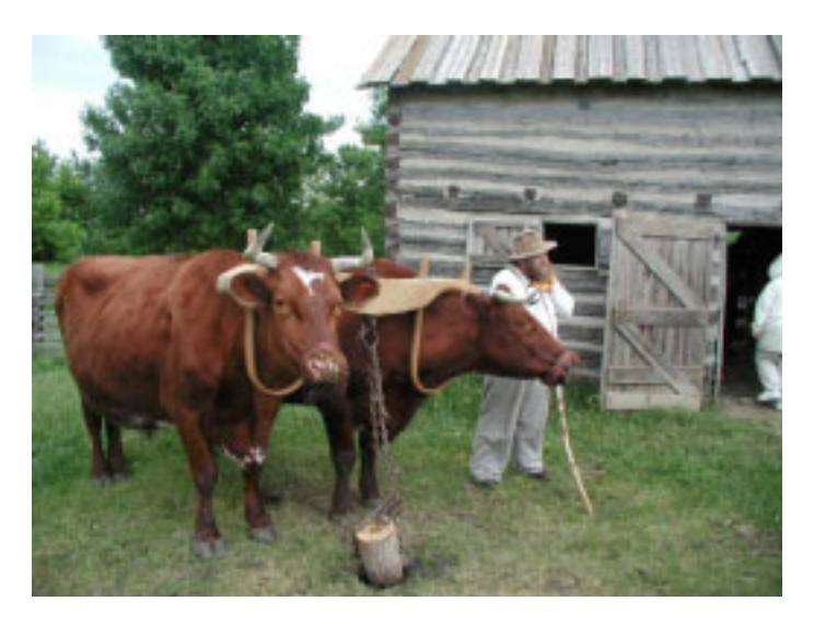
Buck, left, and Barry, power sources of another generation, pose with their drover. They are part of the interpretive "timeline" at FarmAmerica near Waseca, MN. We ended our Tour Day there with a visit, supper and entertainment

There were many more organized activities that made this conference outstanding and one to be remembered for the next thirty years. As always, the interactions between old friends, (and new friends), and acquaintances capped off the organized activities. Our congratulations and thanks to the many organizers from South Central Technical College for producing such a great conference. We look forward to seeing everyone at Number 31.