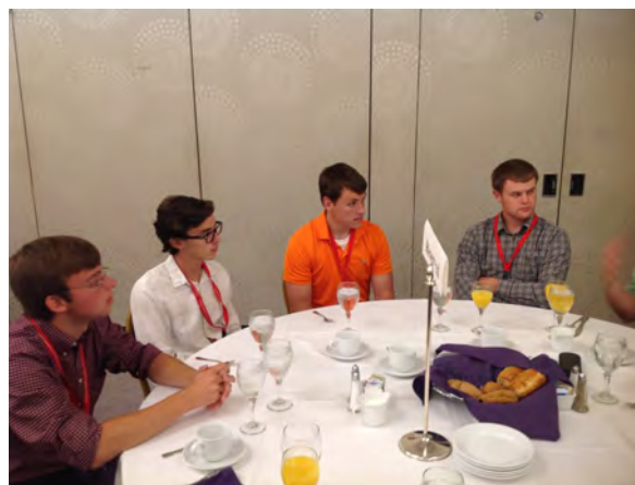
Some of the 2015 CHS Scholarship Recipients