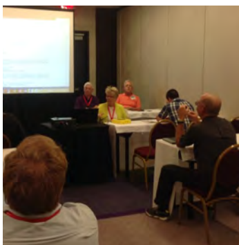
One of the Wednesday afternoon Breakouts