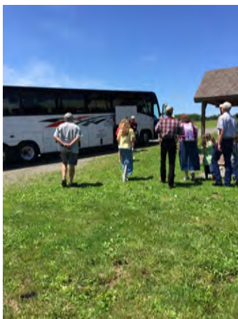
Nice day to be out and about