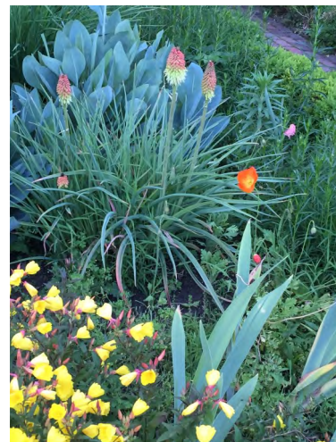
Eastman House gardens