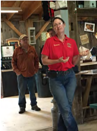
Explaining how they plant & harvest pumpkins.