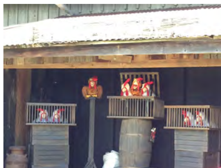
The "Chicken Show": the air-driven characters move and "sing" to a soundtrack. Their show changes to fit the fall or holiday season.