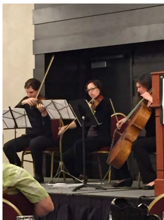
Performers from Eastman School of Music entertained us Sunday evening