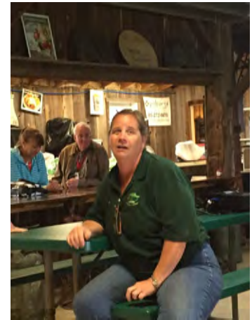
Explaining how they market their agro-tourism business.