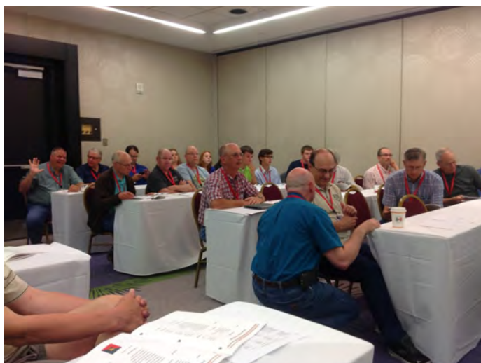
Our Annual Business meetings help to make sure NFRBMEA continues to run smoothly, but they can have their lighter moments too.