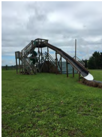
Big slide for the kids to play on during their fall festival