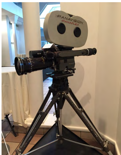
George Eastman House