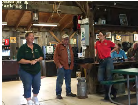
The Stokoe Family