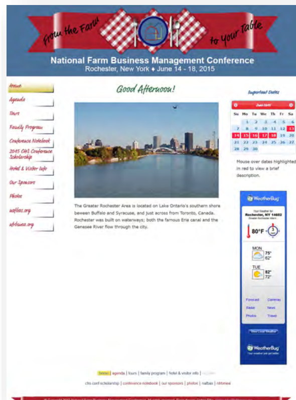
2015 Conference Website