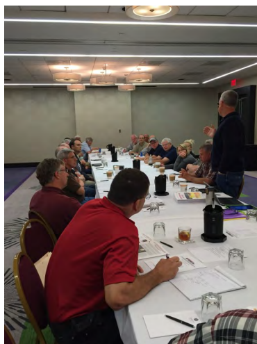
Post-Conference Board Meeting