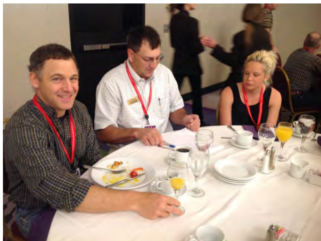
Monday morning First-Timers' Breakfast