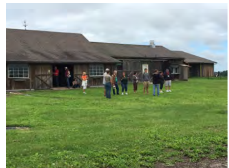
Stokoe Farms is located in rural Scottsville, NY