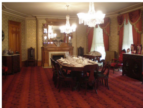
Dining room of the Beehive House, Brigham Young's residence