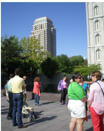
The Monday morning Garden Tour gave spouses a chance to catch up with each other in a beautiful setting.