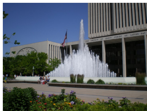
Just one of the many beautiful fountains and water features in the Temple Square Gardens