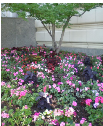
Impatiens, Geraniums, Wax Begonias, Coleus and Tradescantia