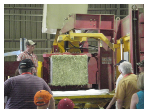
Hay Compressing Machine at Bailey Farms International