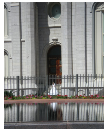
Temple Square Garden Tour: Bride reflected in pool.