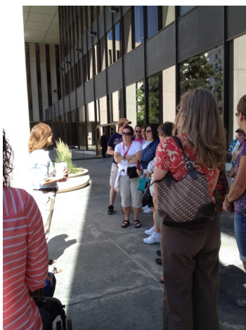
Monday Morning Spouse Activity: Our guide gave us an overview of the Temple Square Gardens.