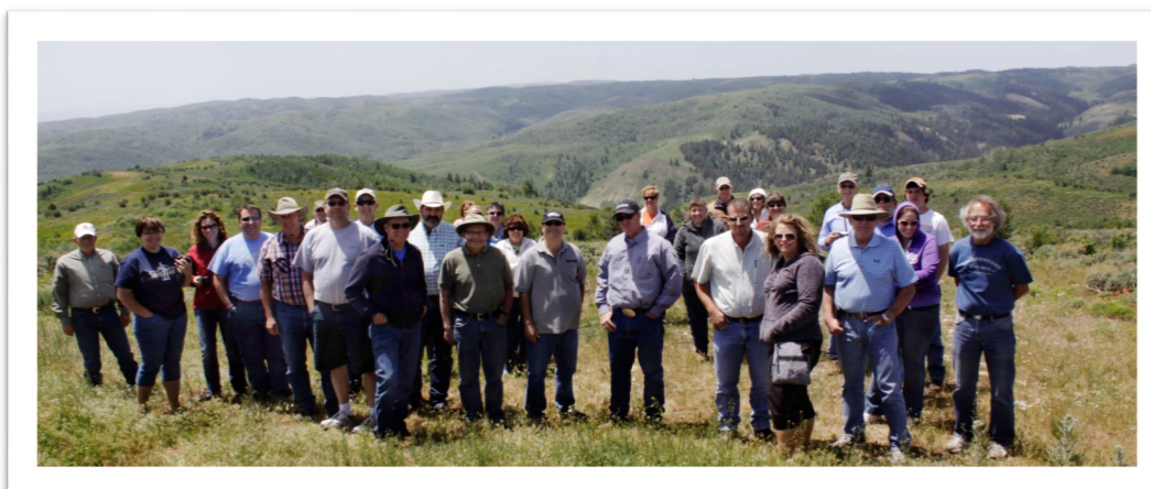
Post-Conference Tour Group that traveled to Deseret Land & Livestock Company