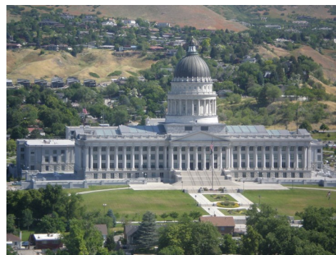
The Utah State Capitol, viewed from the Church Office Building 28th Floor Observation Deck