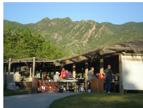
Our Wednesday night picnic was held at This-Is-The-Place State Park & Outdoor Bowery