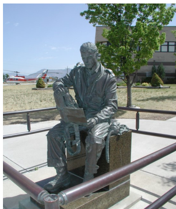
Bronze sculpture "WWII Airman" by James Avati at the Hill Aerospace Museum Tour