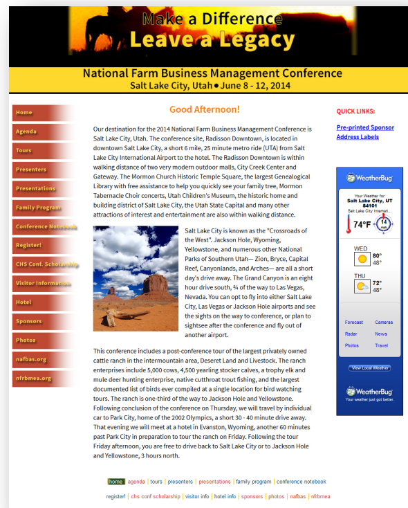
2014 Conference Website