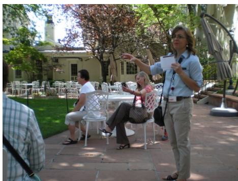
Courtyard behind Lion House and Beehive House, Temple Square Garden Tour.