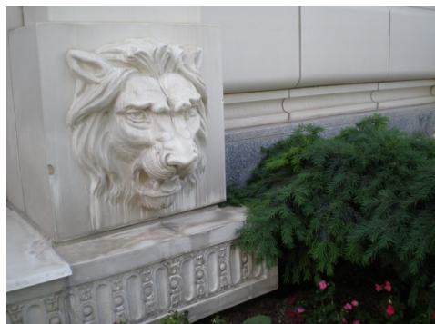
Joseph Smith Memorial Building