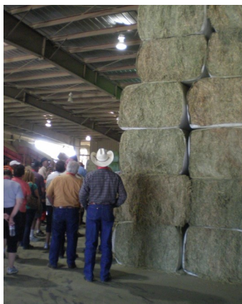
Touring hay processor and exporter Bailey Farms International