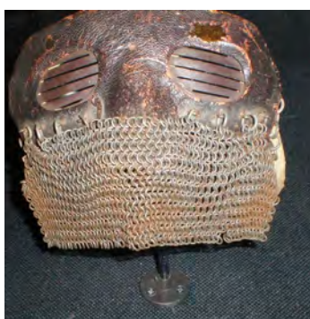
Splinter goggles (mask) for tankers. Worn by the British, American and French to protect them from splinter and bullet splash.