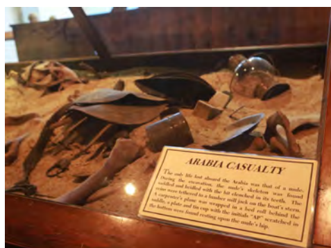
The only casualty of the sinking of the Arabia was a carpenter's mule