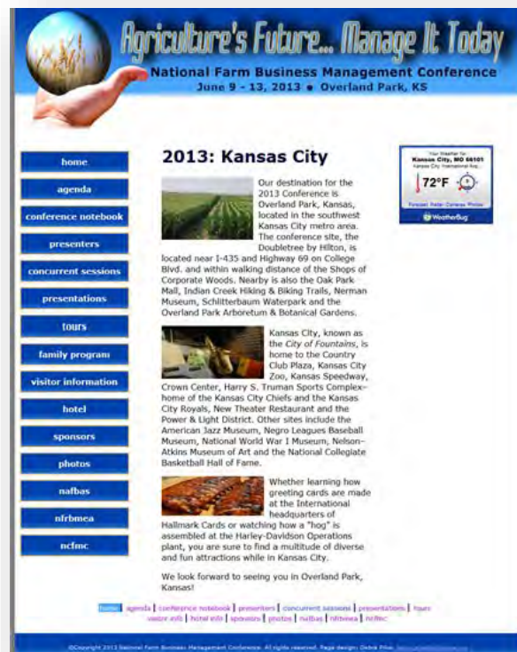
2013 Conference Website