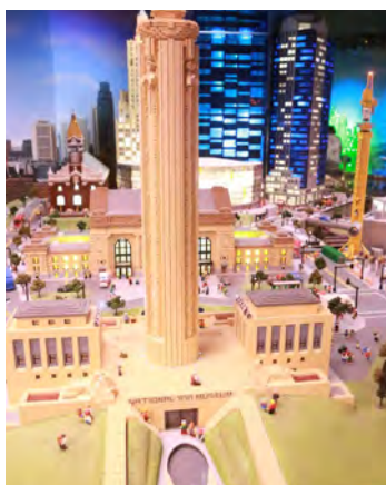
A model of the National WWI Museum constructed of Legos at the LEGOLAND® Discovery Center