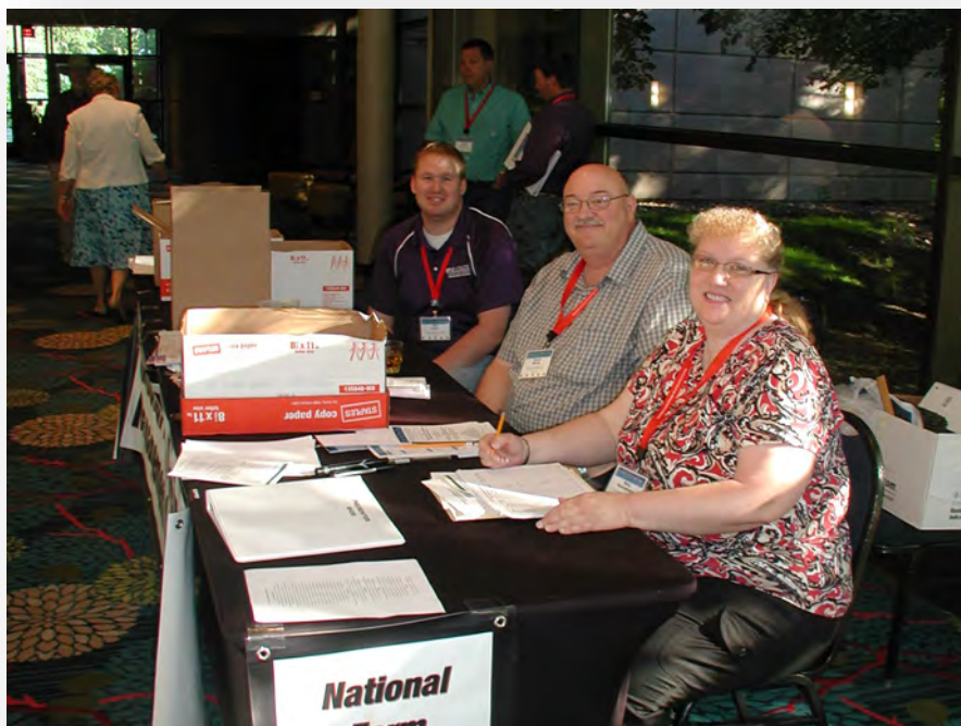
Welcome to the 2013 NFBM Conference

Please feel free to contact me if you have any questions, or for more information you can always visit the new NCAE website at: https://www.ffa.org/thecouncil/ .