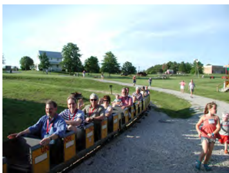
Kids, big and small, enjoyed the miniature train ride at the National Agriculture Center and Hall of Fame