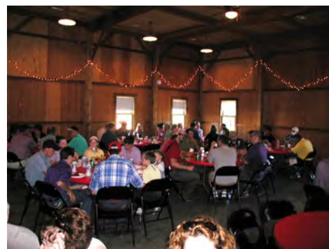
Evening group event at the National Agriculture Center and Hall of Fame, Bonner Springs, KS