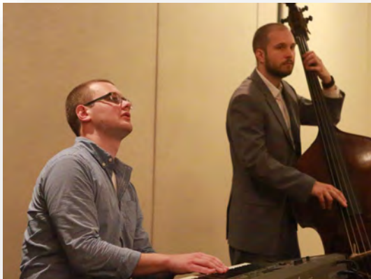
Jazz entertainment during the Sunday Evening Social