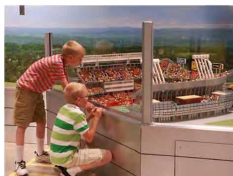
A model of Arrowhead Stadium, home of the Kansas City Chiefs, constructed of Legos