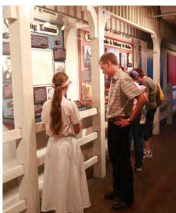
Learning about what it was like to travel on a steamboat