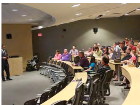
We also toured the Kansas State-Olathe campus — Photo: Lauri Olsen