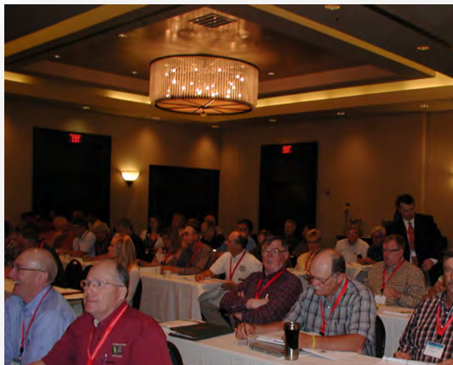
Getting ready to start Monday morning sessions