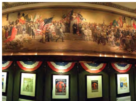
Panorama of a portion of the "Panthéon de la Guerre" mural in Memory Hall