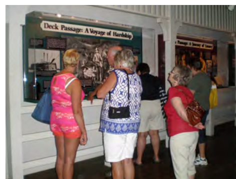
There was much to read about what it might be like to travel on a steamship, and what it was like to live back then.