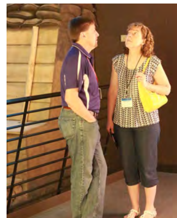
Looking at a cross-section of a foxhole