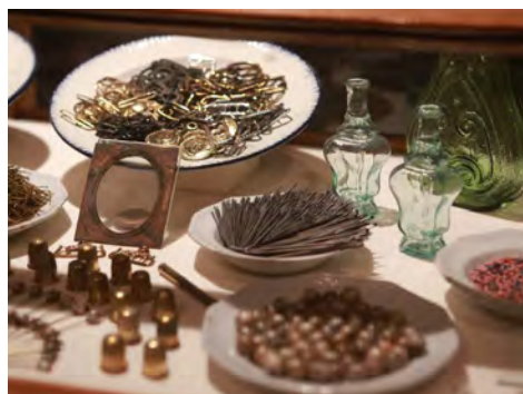
Sewing Supplies — Photo: Lauri Olsen

We had an excellent tour guide at the Steamboat Arabia museum. He had a good sense of humor and interacted well with kids and adults.