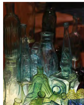
Colorful glassware and perfume bottles.