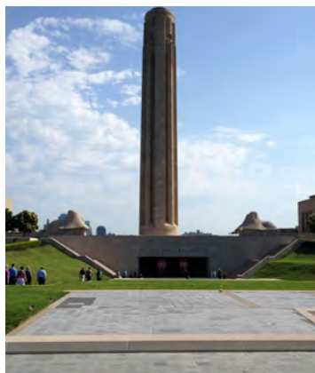
The National World War Museum at Liberty Memorial, Kansas City, MO