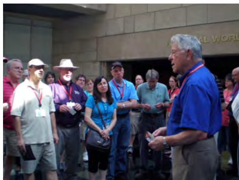
One of the museum staff gives us an overview of the museum.