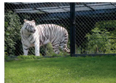
Chahinkapa Zoo

On Wednesday, they visited Bonanzaville USA in West Fargo and the Chahinkapa Zoo in Wahpeton, ND. They rounded out their busy day with the evening family outing to the Hjerkomst Center.