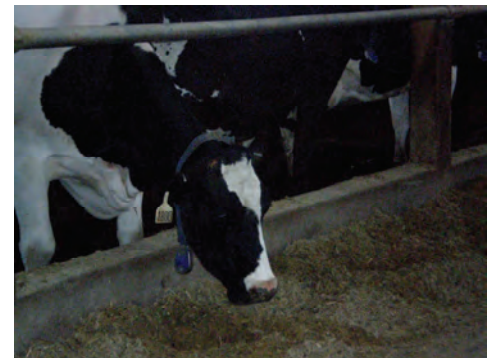
Touring a Hutterite Dairy near Fargo-Moorhead