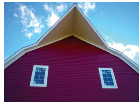
Bagg Bonanza Farm