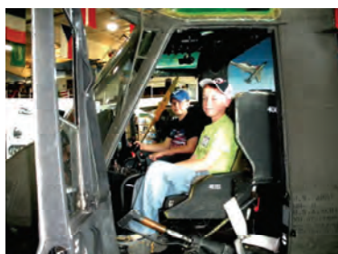
Fargo Air Museum

On Wednesday, they visited Bonanzaville USA in West Fargo and the Chahinkapa Zoo in Wahpeton, ND. They rounded out their busy day with the evening family outing to the Hjerkomst Center.