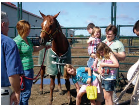
Making a friend at the NDSU Equine Center