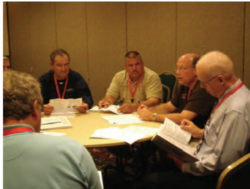
National Institute (IABME) Committee Meeting

See www.nfrbmea.org for complete Board contact information.