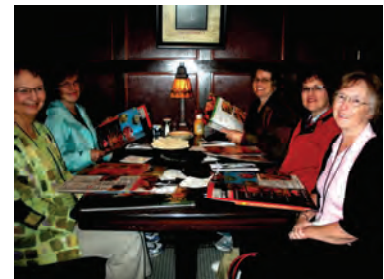
Lunch out in Fargo

On Tuesday, the spouses and families visited the Fargo Theater, where they were given popcorn and a drink and listened to a brief history of the theater, which included the names of all the famous people who had performed there. Then they watched the classic Cary Grant-Leslie Caron movie, “Father Goose”, which everyone enjoyed. This activity was followed by lunch in downtown Fargo and visit to the Fargo Air Museum in the afternoon.