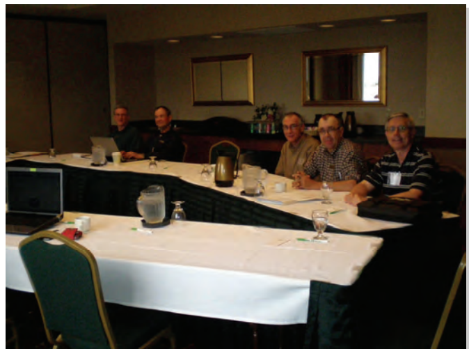
2010 Pre-conference Board Meeting