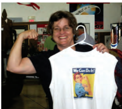
Shopping: We Can Do It!