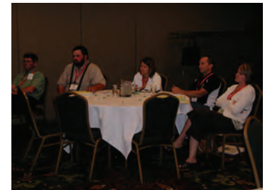
2010 IABME Participants

Thirteen instructors from four states, WI, ND, SD and MN, joined the Institute in 2011. They were encouraged to participate in Webinar training, Regional Meetings, the National Farm Management Conference, and the Institute Workshop. The Institute is also supporting two new South Dakota instructors' participation in Minnesota's PEP program.