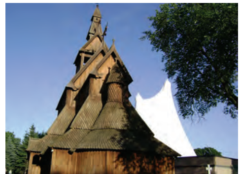
Stavkirke on the Hjemkomst Center grounds