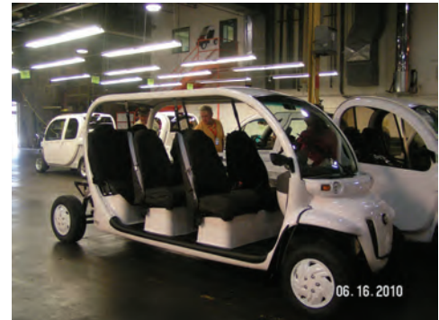
Global Electric Motorcars (GEM), leading manufacturer of Low Speed Neighborhood Electric Vehicles