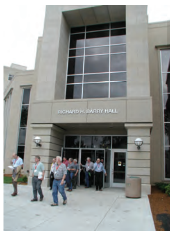
We headed over to Richard H. Barry Hall, NDSU campus, for several interesting presentations