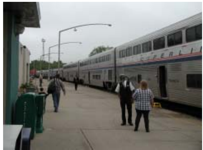
North Dakota may seem like a long way from anywhere, but it is easy to get to by car, air, and train. Minot is on the Amtrak Empire Builder route. A large contingent of Minnesota NFRBMEA members rode the train to and from our 2003 conference.

There is no doubt that we got a lot in Minot. We went home recharged and full of new ideas to try within our own borders.