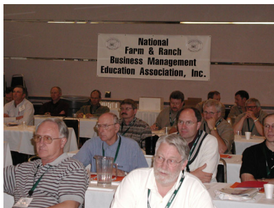
Many educational opportunities are available during our conference tours and workshops

NFRBMEA, Inc. has met annually since 1973. Each conference has workshops, tours, and top-notch speakers. The annual conference is held in locations throughout the U.S.